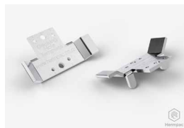
Hermpac Deck Hole Template