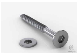
Hermpac Hex Drive Stainless Steel Screw