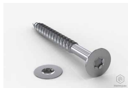
Hermpac Torx Drive Stainless Steel Screw