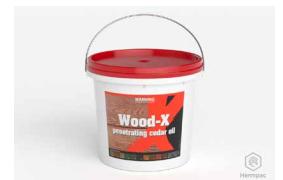
Wood-X Penetrating Wood Oil

Disclaimer: All information provided in this brochure, our website and related documentation are provided on a best endeavors accuracy basis only and without any representation or warranties, expressed or implied and none of the information provided in this brochure constitutes or is meant to constitute advice of any kind. You should always consult and rely on advice of your local building authority, your own professionals, including a professional engineer during the design process. Check with your local Building Consent issuing authority for clarification of the exact fixing requirements on your building site. Hermpac does not recommend the use of wide board decking (115mm and wider) over a waterproof membrane or where the decking will be within 300mm of ground level. When decking is being used over a waterproof membrane ensure that the membrane is compatible with Wood-X Hardwood Decking Oil.