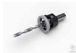
Countersink Drill Bit